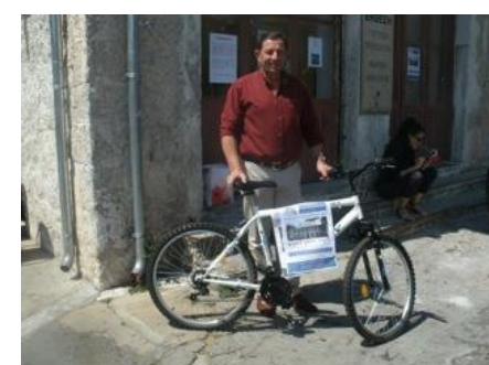
The lucky winner