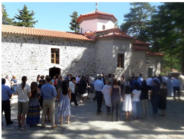
Photos from the passage of the sacred icon of Saint Paraskevi