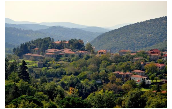
View of Rachi from the Karyes Forest