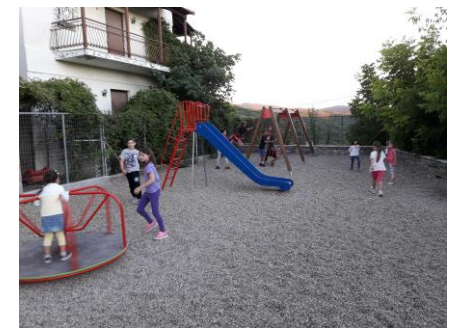
The Kids play in the renovated playground

Let us not forget that Karyes can now be the base for daily excursions up the beautiful Mount Parnon with its untouched forest, the villages and monasteries, as well as the beautiful sites of Laconia and Arcadia, Mystras, Mani, Monemvasia, Mainalo, Taygetos, Gortynia, and Megalopoli, to mention a few. Moreover, with the improvement of the road network anyone can easily access the beaches of Gytheion and Astros for a morning swim! Finally, it is important to note that there is a modern grocery store and a pharmacy which can attend well to the visitors immediate needs, while the two big cities Sparta and Tripoli are less than half an hour away!